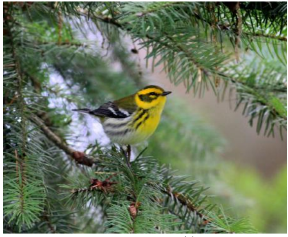
Townsend's Warbler December 2012