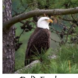
Bald Eagle leff Meaux APA_NAS