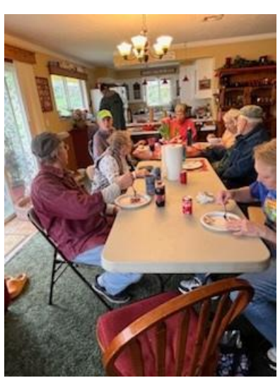
We took a break for lunch